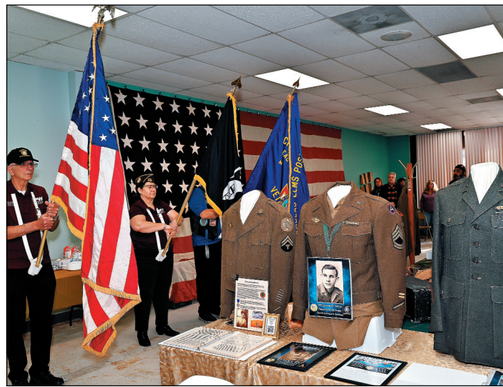
Exhibits were set up last November in the Pitkin Street storefront.

The World War II Legacy Foundation, Inc. of East Hartford is pleased to announce the location and opening of what will become the Connecticut World War II Museum, Research & Education Center. The museum will be located at 102 Pitkin Street, East Hartford. Since opening on April 4th, programs have already taken place with at least two more planned this month. On display will be memorabilia and information about the Pacific and European Theater of Operations as well as the different groups that took part in achieving victory for our country. Included will be displays about the home front and workers who supported the troops overseas. In 2022, East Hartford was the only town in Connecticut to be designated a World War II Heritage City. The World War II Museum, Research & Education Center will be the only museum in Connecticut dedicated solely to World War II. Co-Founders of the museum invite the public to take a tour