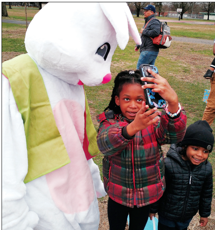
TIME FOR A SELFIE WITH THE BUNNY Sunday at the Parks & Recreation Department's annual Egg Hunt at McAuliffe Park.