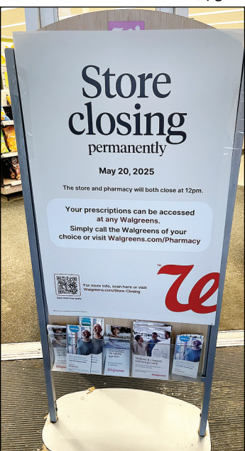
Sign at Silver Lane Walgreen's