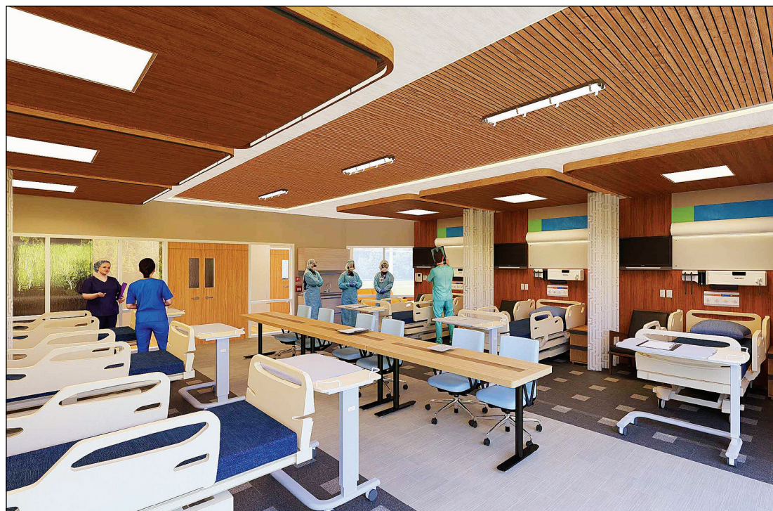
Capital Studio Architects rendering of Goodwin University's new Nursing Simulation Center.